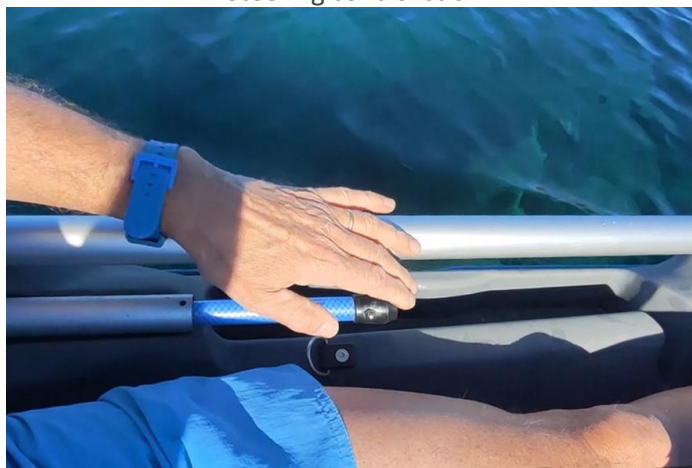
Steering control stick