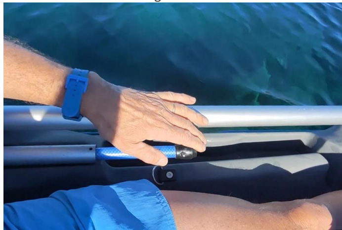
Steering control stick