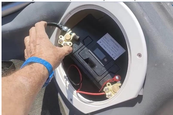
Battery connection, in a waterproof compartment