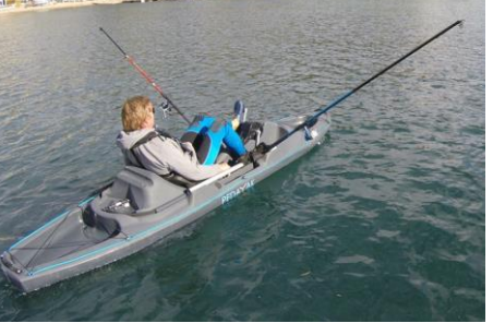
Keels, shaft, propeller & rudder